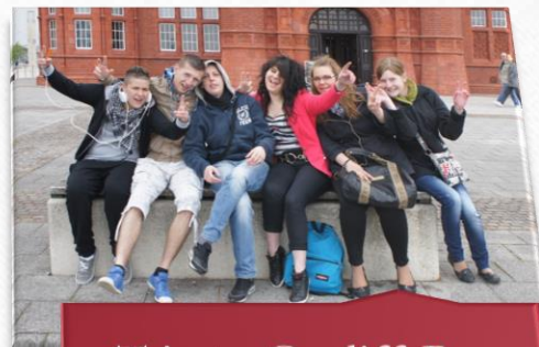
Trip to Cardiff Bay