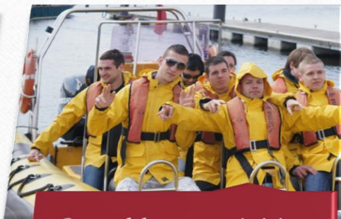
Speed boat activities