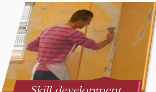
Skill development Restoration & painting