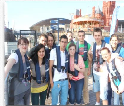
Day trip to Cardiff Bay